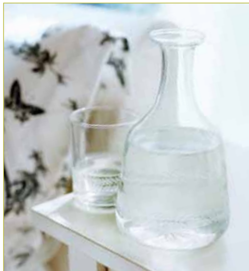
©2010 Simmons Bedding Company. All rights reserved.

❧ FOR MORE INFORMATION ABOUT THE WORLD OF MATTRESSES AND BETTER SLEEP, VISIT WWW.SIMMONS.COM .